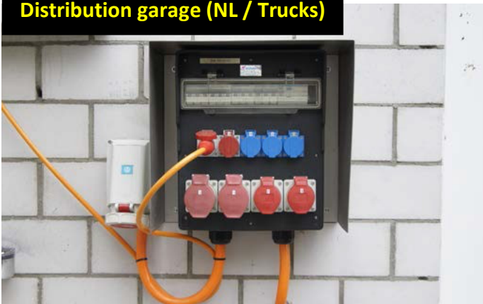
Distribution garage (NL / Trucks)