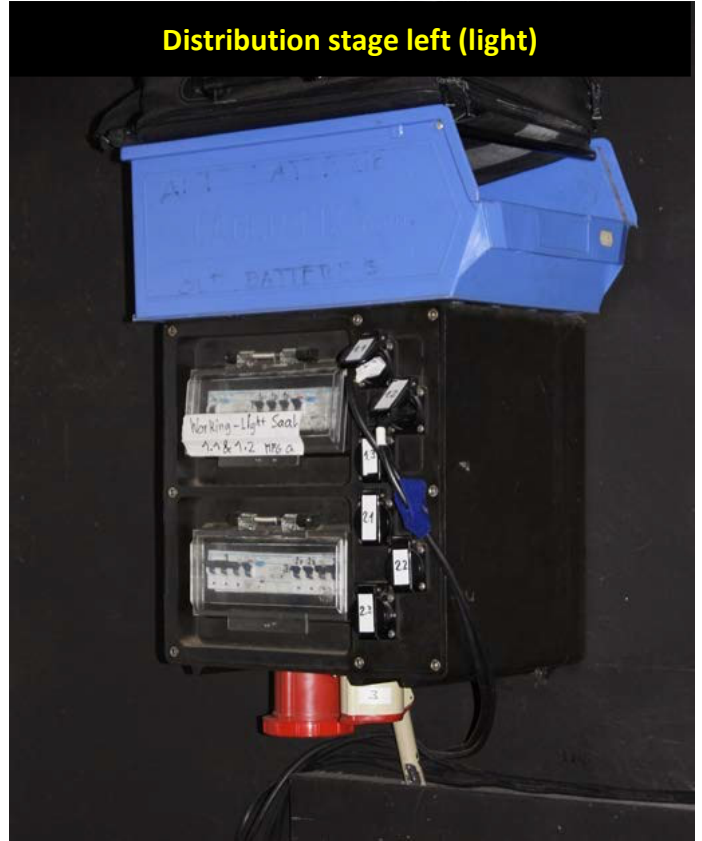
Distribution stage left (light)