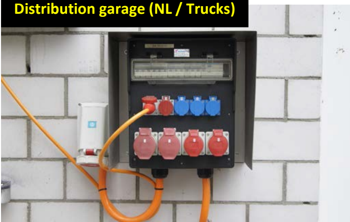
Distribution garage (NL / Trucks)